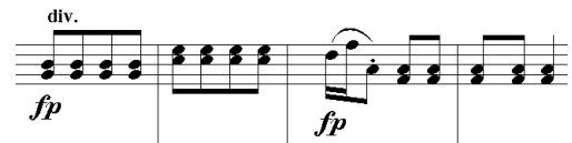
„Auf Wiener Art“, Auszug aus der Partitur

Instr.: 2 Fl, 2 Ob, 2 Klar in A, 2 Fg; 3 Hr in F, 2 Trp In F, 3 Pos; Pk + Perc; Str.